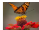
Zoology for Teachers

ALL SCIENCE TEACHERS SEEKING ENDORSEMENTS. THE COURSES START ON MAY 26TH IN AN ONLINE SETTING. TEACHERS CAN MAKE TIME IN THE WEEK WHEN IT WORKS FOR THEM. EACH COURSE IS SETUP ON A 12 WEEK SCHEDULE AND REQUIRE BETWEEN 4-6 HOURS A WEEK. EVERY WEEK INCLUDES FOUR MODULES: CONTENT LEARNING, DISCUSSION, CLASSROOM APPLICATION, AND A WEEKLY WRAP-UP ASSIGNMENT. TOTAL COST IS $500 FOR UTSTA MEMBERS. CONTACT YOUR DISTRICT FOR REIMBURSEMENT OF $500.00.