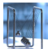
Modern Physics for Teachers