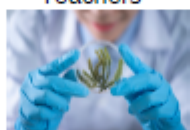
Chemistry 2 for Teachers