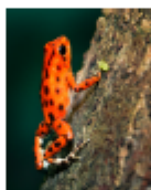
Evolutionary Bio for Teachers