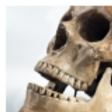
Anatomy for Teachers