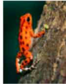
Evolutionary Bio for Teachers