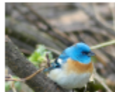
Ecology for Teachers