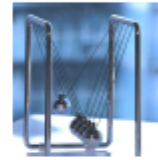
Modern Physics for Teachers