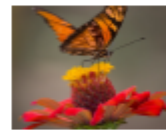
Zoology for Teachers

ALL SCIENCE TEACHERS SEEKING ENDORSEMENTS. THE COURSES START ON MAY 26TH IN AN ONLINE SETTING. TEACHERS CAN MAKE TIME IN THE WEEK WHEN IT WORKS FOR THEM. EACH COURSE IS SETUP ON A 12 WEEK SCHEDULE AND REQUIRE BETWEEN 4-6 HOURS A WEEK. EVERY WEEK INCLUDES FOUR MODULES: CONTENT LEARNING, DISCUSSION, CLASSROOM APPLICATION, AND A WEEKLY WRAP-UP ASSIGNMENT. TOTAL COST IS $500 FOR UTSTA MEMBERS. CONTACT YOUR DISTRICT FOR REIMBURSEMENT OF $500.00.